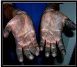
This is my identity